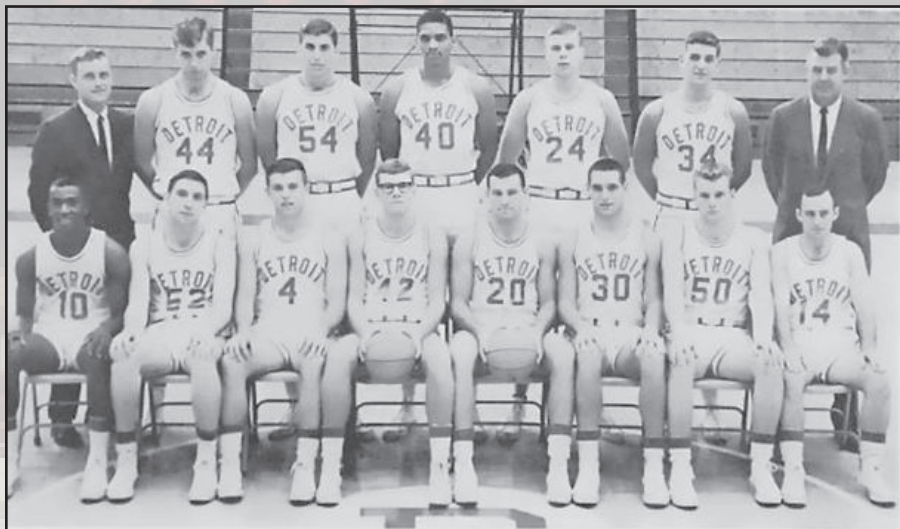
The 1964-65 Titans won the first-ever game in postseason history beating La Salle in the NIT